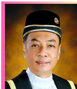
JUSTICE TUAN NADZARIN BIN WOK NORDIN High Court Judge of Kuala Lumpur (Construction)